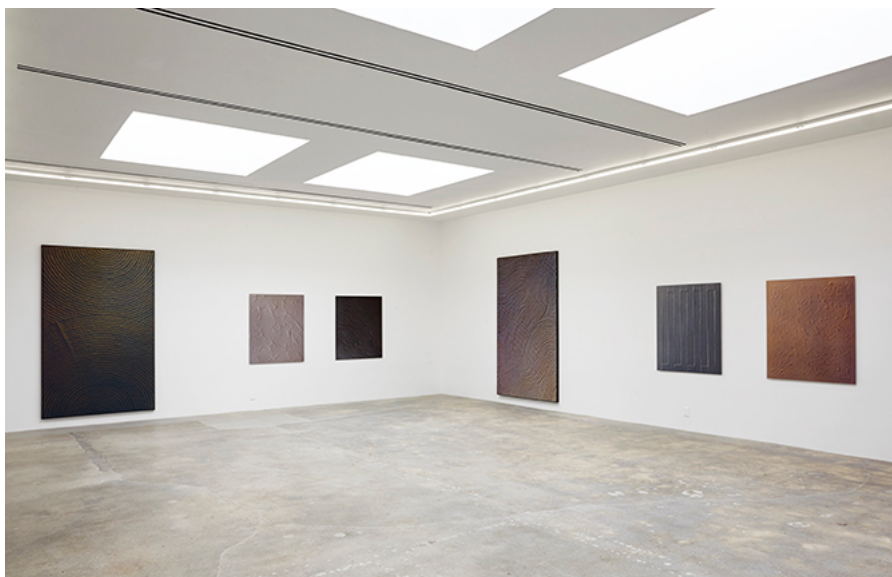
Various Small Fires' main gallery

Mark Moore Gallery, 5790 Washington Boulevard, Culver City, Los Angeles, CA, USA, +1 310 453 3031