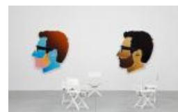
7 Artists from Los Angeles Every Chinese Art Lover Should Know