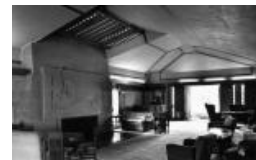
Julius Shulman: Defining Mid-Century Chic Though Architectural Photography