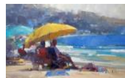
Carmel-by-the-Sea's 10 Best Art Galleries: California's Small-Town Art Paradise