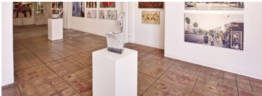
Interior of the gallery