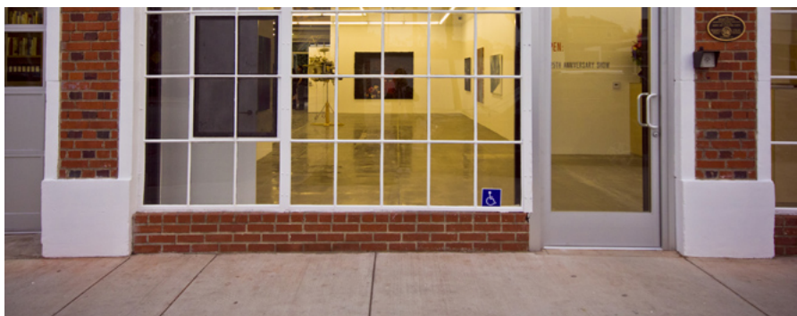
Exterior of the gallery